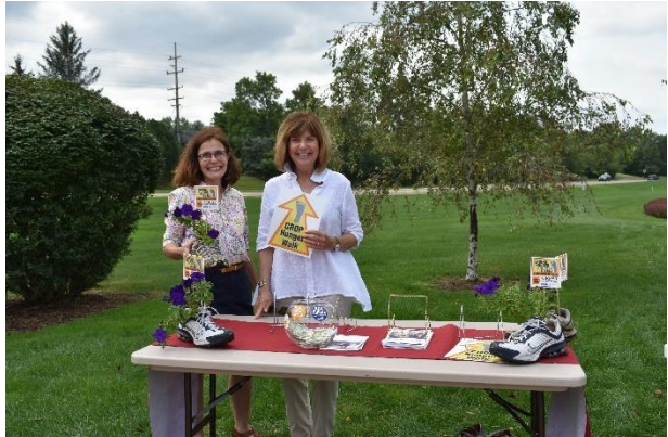
Church World Services CROP Walk for Hunger

Kirk in the Hills, in partnership with five other area churches, raises money annually to help Church World Services address hunger scarcity worldwide. Funds raised in 2021 also supported earthquakeravaged Haiti. Six local agencies, including Lighthouse, Baldwin Center, and Grace Centers of Hope, each received $1,000. In 2021, the Birmingham/Bloomfield area CROP walk raised more than $31,200 and came in 44<sup>th</sup> out of the top 100 U.S. CROP Walks, collectively known as the Cream of the Crop. Individually, Kirk in the Hills raised $15,000 of that total and was ranked the eleventh highest fundraising church in the nation.