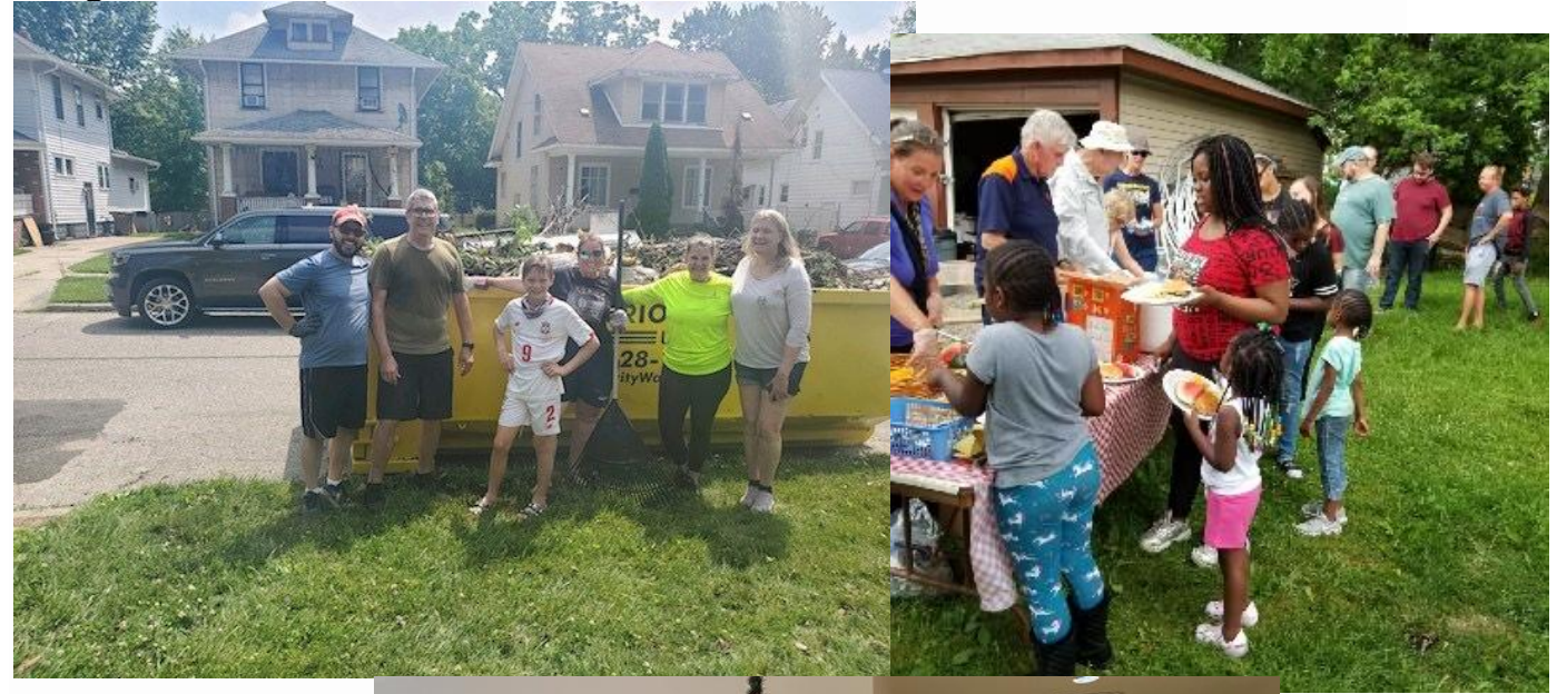
Micah 6 Dinners