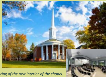
Rendering of the new interior of the chapel.

Here at the Kirk, we recognize the importance of prioritizing the formation of our youth and young adults. In partnership with Princeton Theological Seminary, the Kirk will serve as one of five "hubs" around the country to foster innovative and sustainable youth ministries. In addition, funds will be dedicated to building our relationship with Alma College by supporting their ongoing initiatives to grow the faith of our young adults.