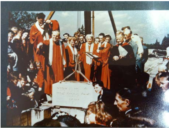
9/23/1951 Laying of the Cornerstone - historical files